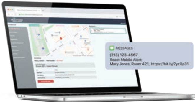
SMS Notification (Link View)