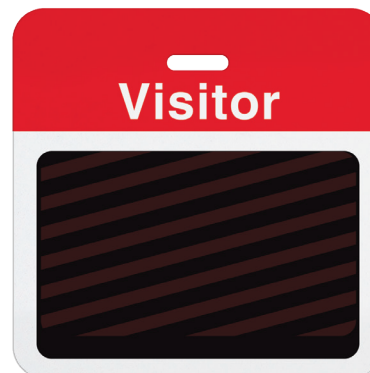
T5913A (3" x 3") Larger sizes Available