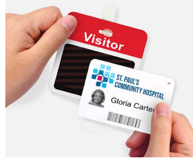
Badge back and front

Clip-On Style Badges with Mix & Match Versatility