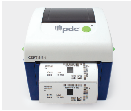
Thermal Medical Label Printers