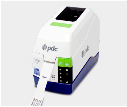
Patient ID Wristbands