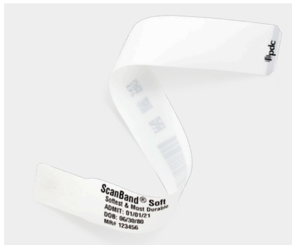
Thermal Patient ID Wristbands