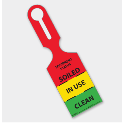
Ident-Alert® Tray & Scope Tags