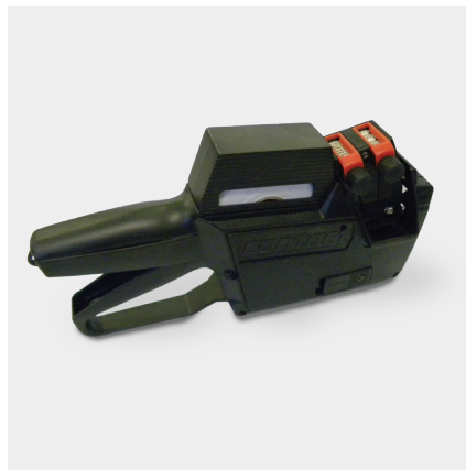
Handheld Label Dispensers & Labels