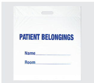
Patient Belonging Bags