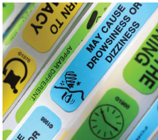
Medication Warning Labels