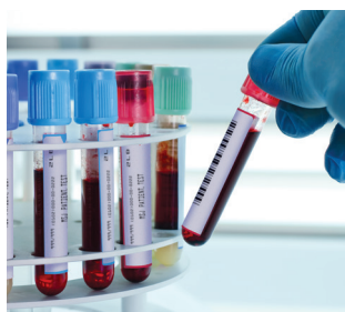
Specimen or Sample Labels