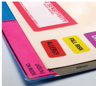
Pre-Printed Binder & Chart Labels