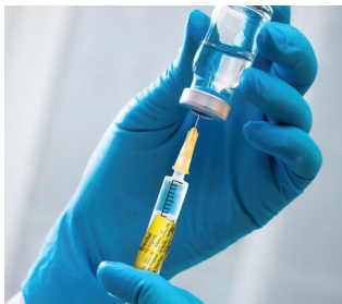
Anesthesia Labels & Tapes

Use these bright, clearly printed labels to help clearly communicate with patients and staff