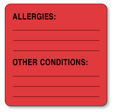
59707226 - Fl. Red (P) MFFRR17 - Fl. Red (R)