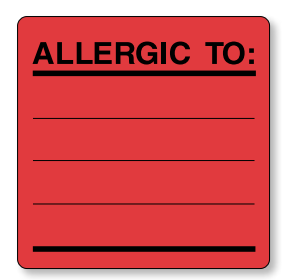
59709438 - Fl. Red (P) MFFRR16 - Fl. Red (R)