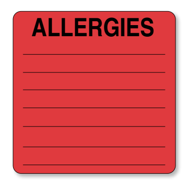
59704568 - Fl. Red (P) MFFRR19 - Fl. Red (R)