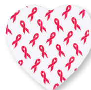
SCPSLV1 Heart-shaped sleeve ribbon design #1 24 sleeves/Pack