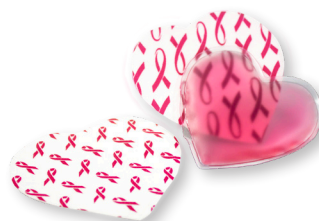
SCPS-50 24 Heart-shaped gel pads/Box 48 sleeves/Box

Gel pads can be placed within a soft brushed fabric sleeve, eliminating the shock of initial contact. Plastic gel pads can be easily cleaned with soap and water. Each gel pad comes with 2 fabric sleeves, one of each design.