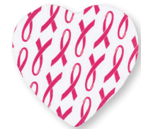
SCPSLV2 Heart-shaped sleeve ribbon design #2 24 sleeves/Pack

Get Free Samples! Contact Us Today 800.435.4242 or visit pdchealthcare.com/mammo to view our complete line of Mammography products