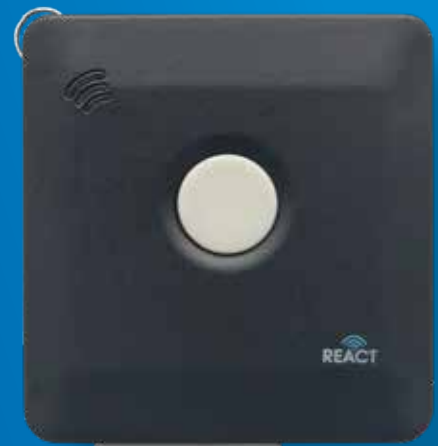
Panic Button (actual size)

A precise, location-based panic button and alert system built for organizations