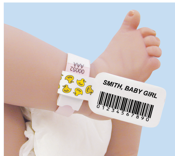
Patient ID and bar code on both sides for easy access & scanning.