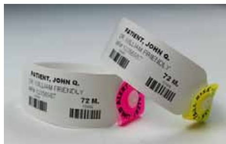
Ident-Alert® 8621 solid, colored, plastic snaps with printed alert text